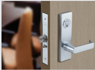
F Trim 2-1/16" W x 7-5/8" H 626 (US26D) Finish Only (Brass Escutcheon)